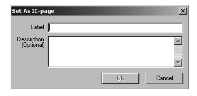
Figure 3: Annotation of WebIC

1. Just as AIE (Zhu, Greiner, and Häubl 2003b), by distributing WebIC to people for their ordinary web browsing, we can collect annotated web logs which can be used to learn general user model or community specified model.