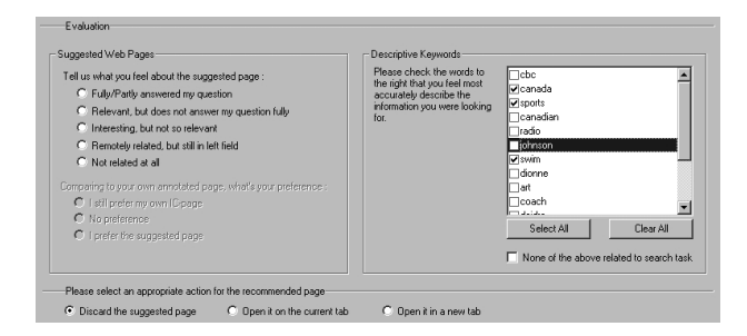
Figure 4: Evaluation Interface for LILAC

they consider to be an IC-page. After marking an IC-page, WebIC will recommend an alternative web page as before (excluding the IC-page), as if the user had clicked "Suggest" here. Once again, WebIC will then ask the user to evaluate this recommended page.