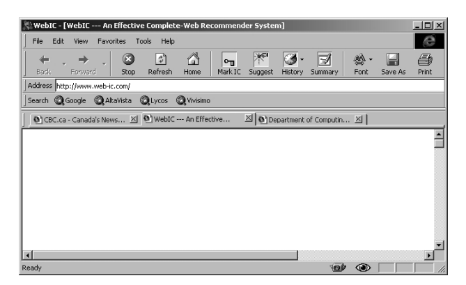
Figure 2: WebIC — An Effective Complete-Web Recommender System

WebIC is an IE-based browser, as shown in Fig. 2, and it has some extensions to facilitate the user study.