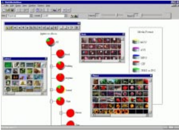
Figure 2: MultiMediaMiner Classifier user interface.

with image and video features in the database. The database used by C-BIRD is an addition to the image repository and contains mainly meta-data extracted by the pre-processor and the Image Excavator, like colour and texture characteristics and automatically generated keywords. MultiMediaMiner, the general architecture of which is shown in Figure 1, inherits the CBIRD database.